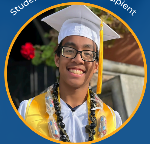
Student Scholarship Recipient

We award scholarships to deserving college students, graduating high school seniors, and foster students who are or have been in the foster care program to pursue accredited degrees.